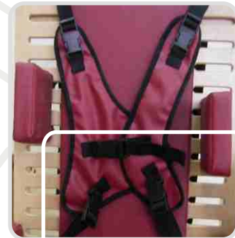
Safety Belt & Lateral Support