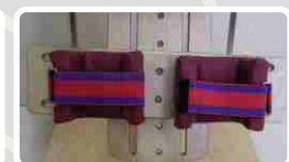
Knee Support Pads