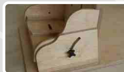
Angle Adjustable Board