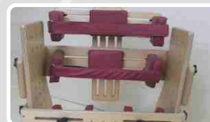
Hip Support Pads and Chest Support Pads