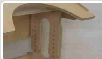
The Height of Tray is Adjustable