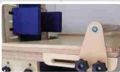
Tray and Hand Bar