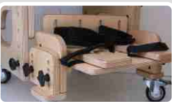
Footplate & Heel Loop