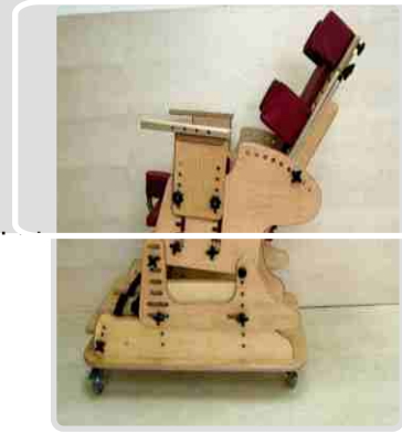
Reclining & Tilt-in