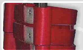
Chest Belt and Hip Belt