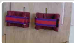
Knee Support Pads