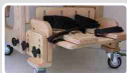
Footplate & Heel Loop