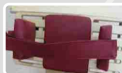
Chest Support Pads