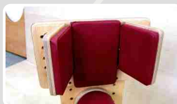
Hip Support Pads