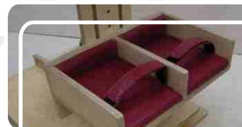
Kneel Posture Plate