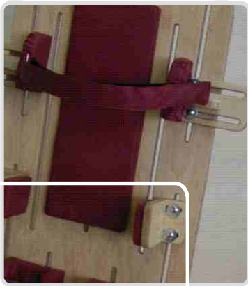
Chest Pads & Hip Pads