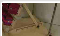
Angle Adjustable Support