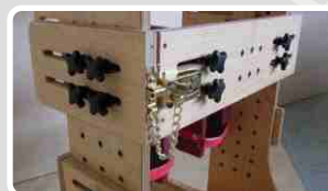
Quick Release Lock