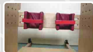
Knee Support Pads