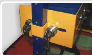
Quick Release Knee Stopper