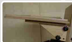
Angle Adjustable Tray