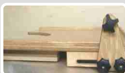
Tray and Hand Bar