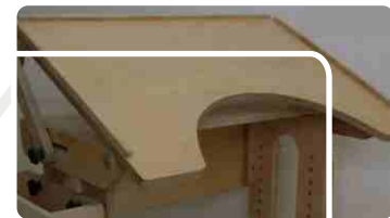
The Angel of Tray is Adjustable