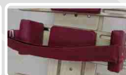
Hip Support Pads