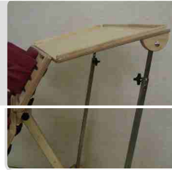
The Angel of Tray is Adjustable