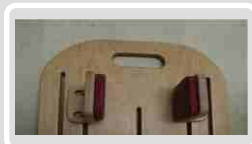
Head Extension Board And Head Pads