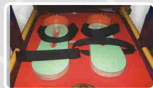
360° Heel Stopper and Straps