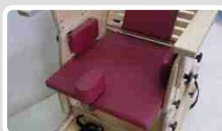
Depth of Seat is Adjustable